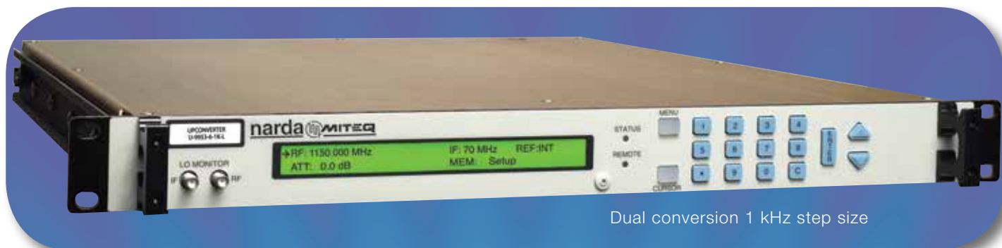
Dual conversion 1 kHz step size